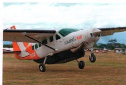
Willy Sage flew this Sounds Air Cessna Caravan and beat some of the Cessna 180 competitors.